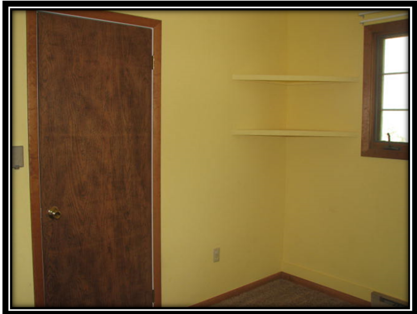
Built-in Corner Shelves On each side Of window