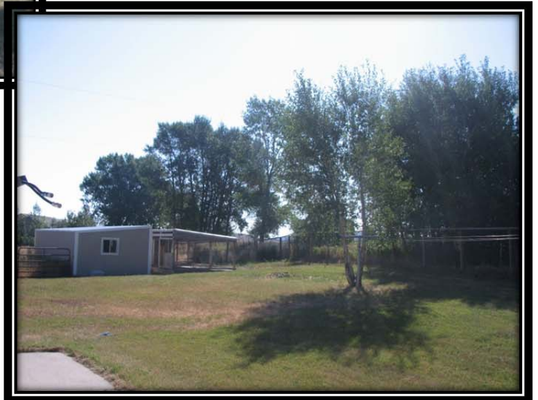
Looking toward Shed & Kennels