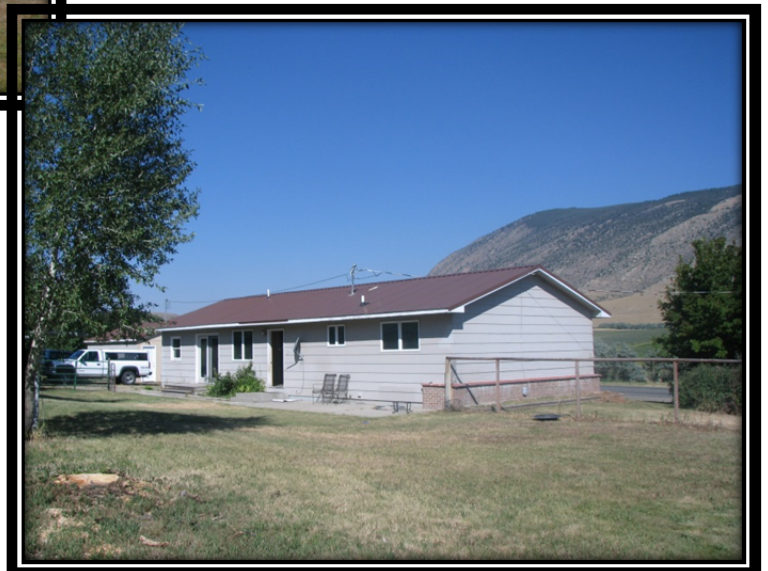
Back View of Home