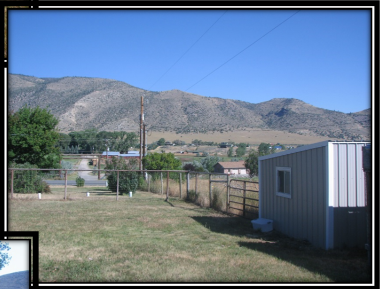
Gate behind shed