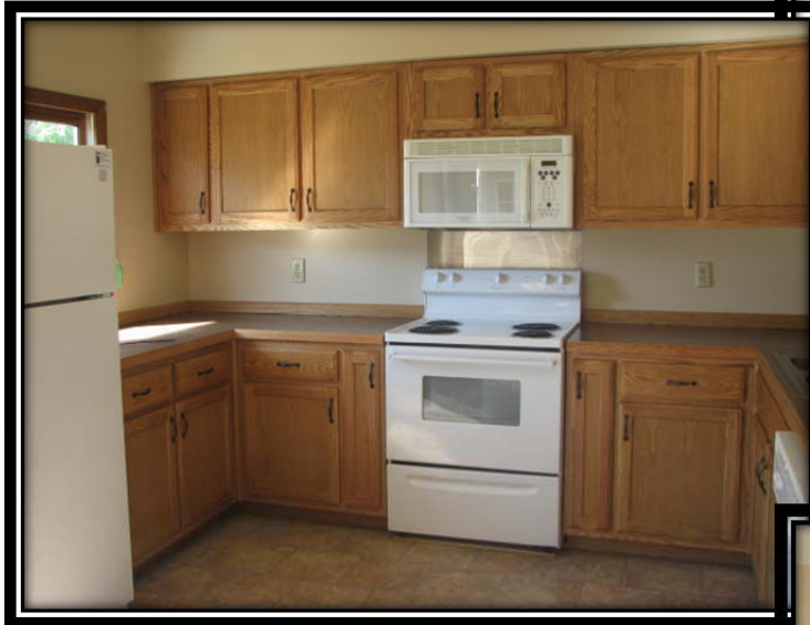
Custom Built Cabinets