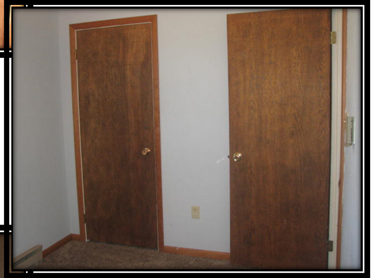
Closet in Bedroom