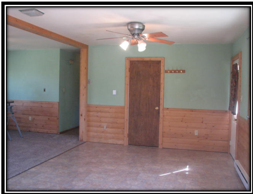
Dining Area Could be part of Living Room