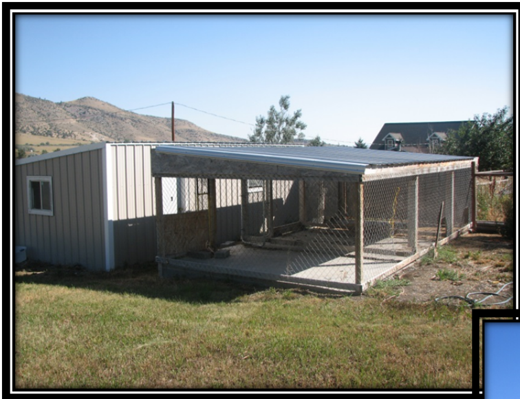
Shed and Kennels