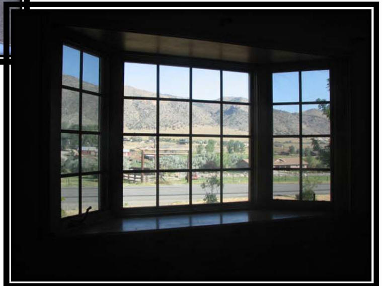
In Living Room