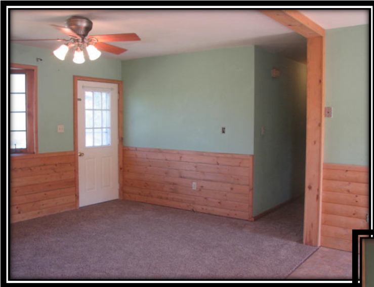
Front door on left