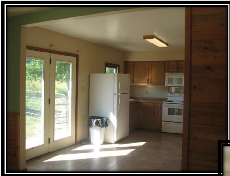
French Doors to Patio