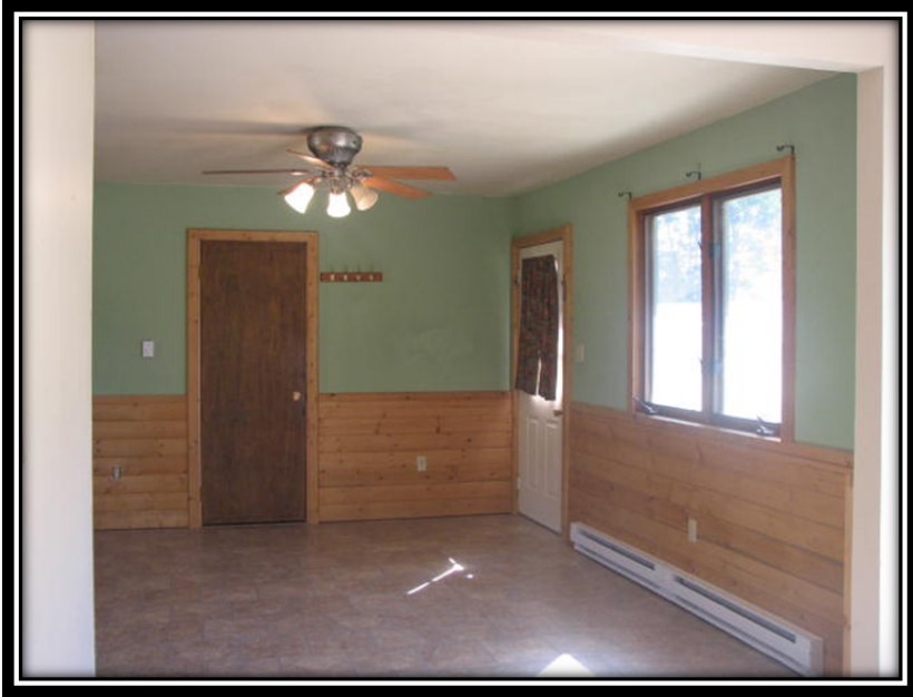
Dining Area Door on left to Pantry