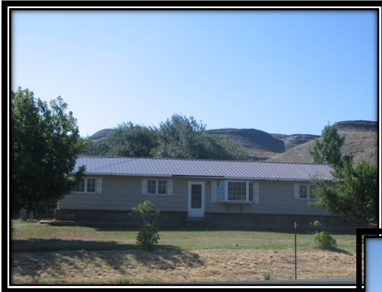
Front View of Home