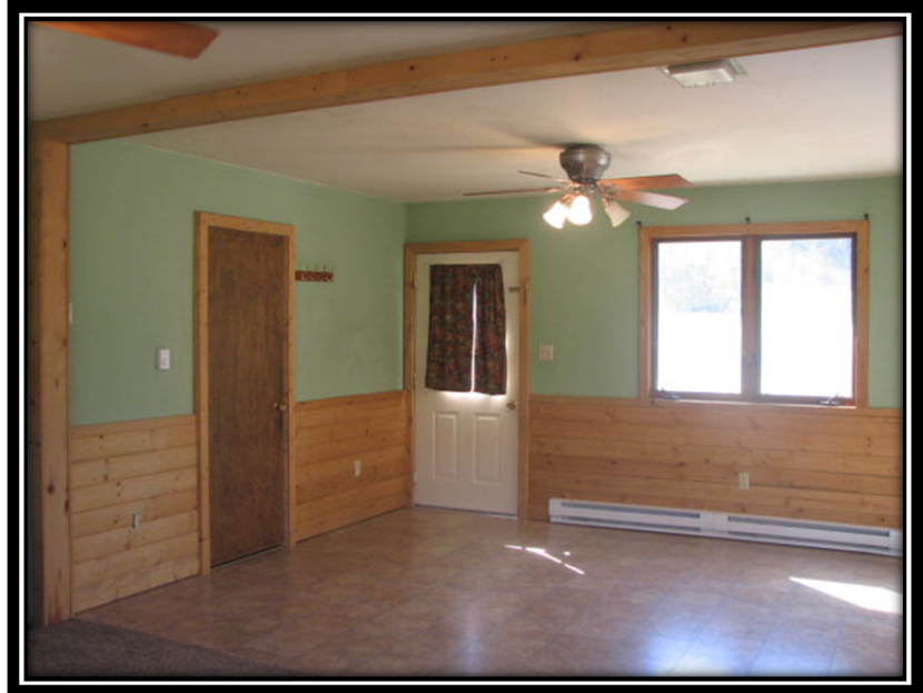
Dining Area Back Door to Patio