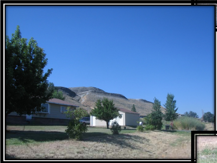
Home & Garage